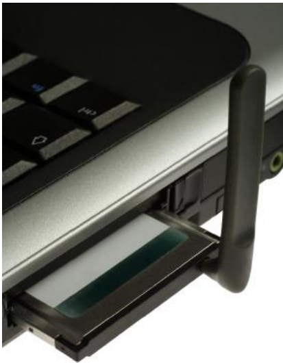
Mobile Data card

Communication device: Can support connectivity between two devices or between device and internet. E.g. Data card or dongle