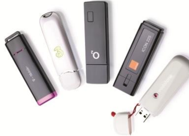
USB Data Dongles