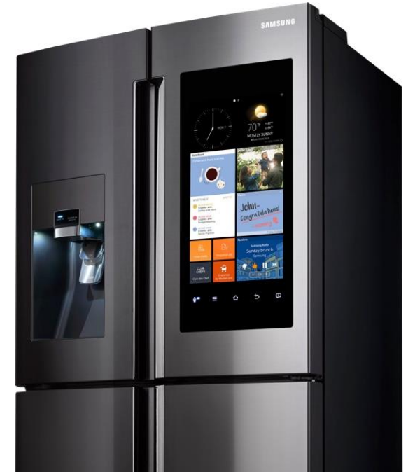
Smart / Connected Fridge