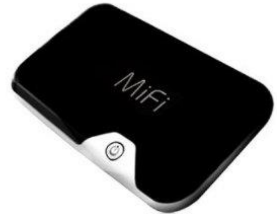
Mobile Wi-Fi hotspot